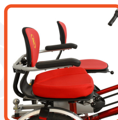
Adjustable seat with seatpillow 5 cm thick