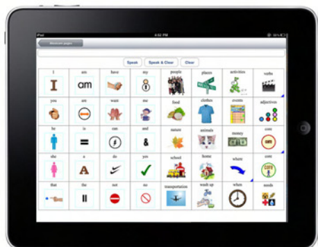
iPad2 with PicSpeechmaker