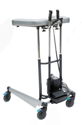
Thera Double/130 Electrical hight adjustment and electrical leg spreading