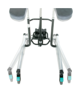
Thera Double has electrical leg spreading for extra space around the client.