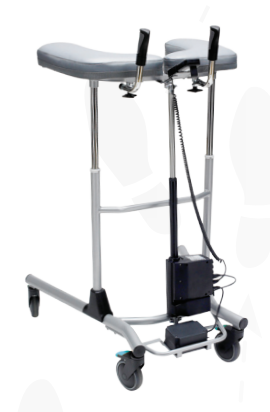
Thera El/150 Electrical height adjustment