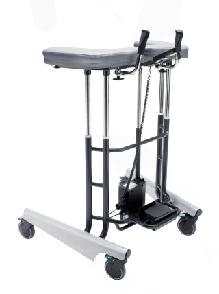
Thera Extra/240 Max. capacity up to 240kg