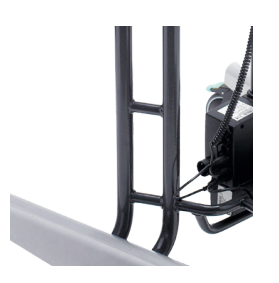
Thera Extra: Double columns for increased bariatric stability.