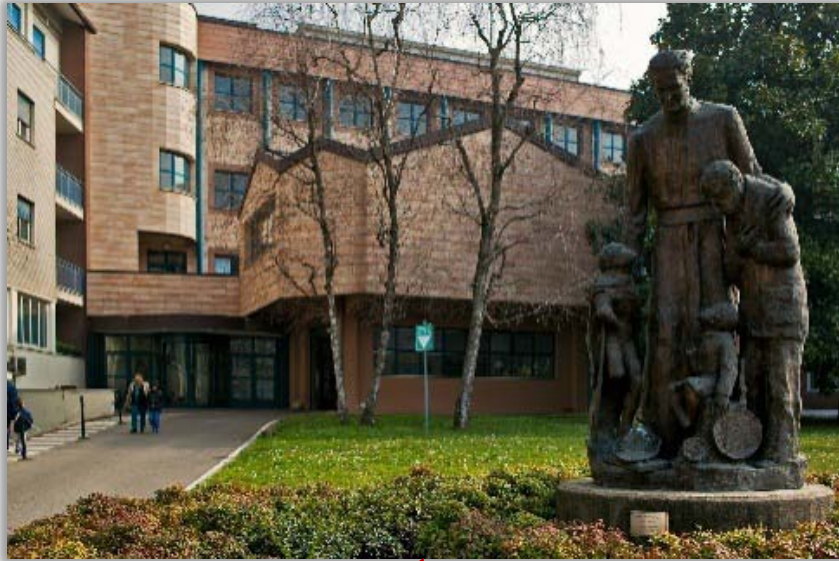
S. Maria Nascente Clinical Research Institute (IRCCS)